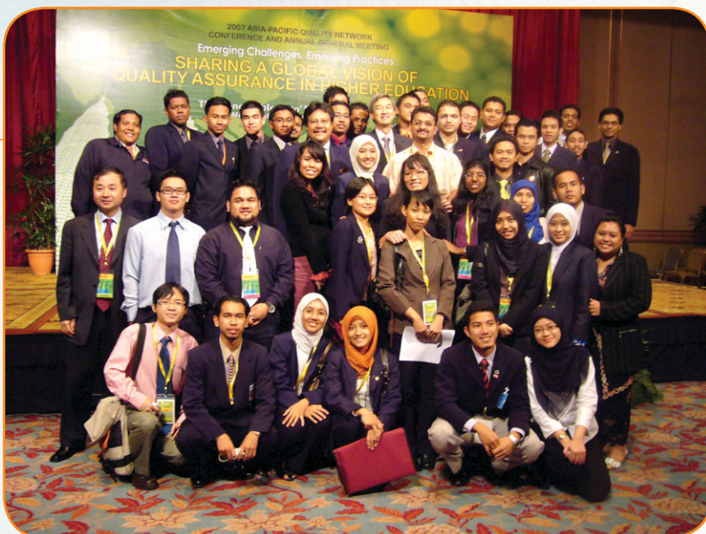
APQN 2007 Conference 2007年度「亞太地區質素網絡」研討會

During the APQN 2007 Conference and Annual General Meeting (AGM) held in Kuala Lumpur, Malaysia in February, the ED, in the capacity of the President of APQN, delivered speeches in plenary sessions and chaired the AGM and two APQN Board meetings. A professional staff also presented a paper on "Hong Kong Qualifications Framework: A Warranty for Quality" at the same event.