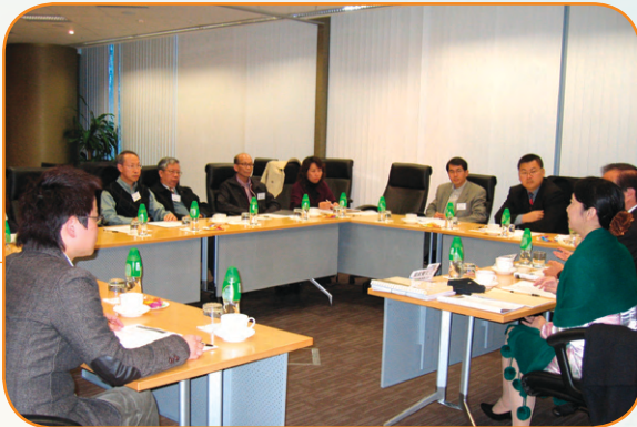
Updating stakeholders with the Council's new developments 向業界提供有關評審局的最新發展

本年度，評審局共造訪了17個工會及專業團體，並定期為合作夥伴舉行工作坊和午餐會，旨在作經驗交流。