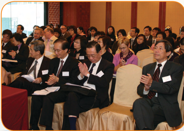
Dialogue with stakeholders 與業界作經常性交流