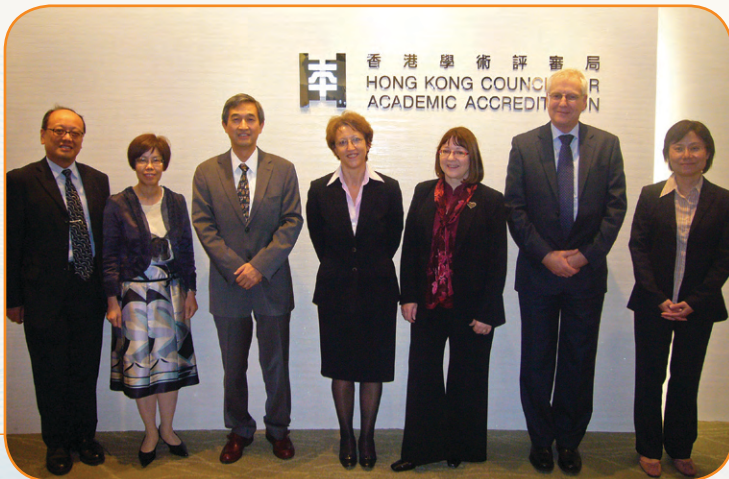
QAA visiting HKCAA 英國高等教育質量保障局來訪

Local visitors in the reporting period included the Hong Kong Quality Assurance Agency, the Council of Hong Kong Professional Associations, the Estate Agents Authority and the Hong Kong General Chamber of Commerce. These visits were for purposes of networking and relationship building with our key stakeholders as well as information sharing on the quality assurance mechanism that is being developed by the HKCAA to underpin the QF.