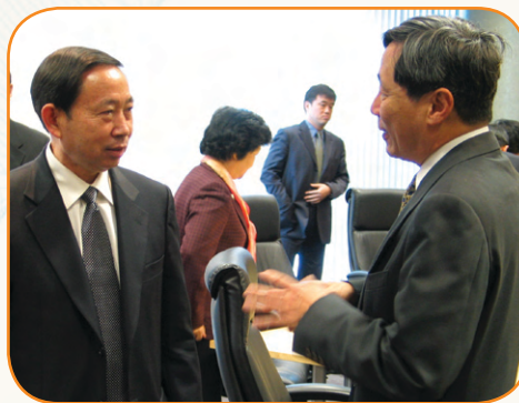
Vice-Minister, Professor Yuan Guiren (left) of the Ministry of Education visiting the Council 國家教育部副部長袁貴仁教授(左)來訪