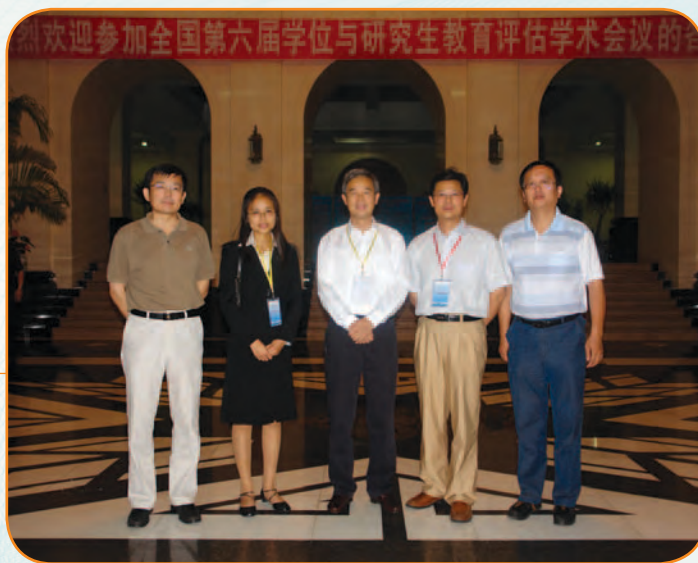
Attendance at the National Conference on Degree and Graduate Education Evaluation in Shenyang 參與於瀋陽舉行之全國學位與研究生教育評估學術會議

2006年8月，總幹事應邀出席在瀋陽舉行之全國第六屆學位與研究生教育評估學術會議。與會期間，總幹事發表了有關香港高等教育質素保證體制的演說。同時，總幹事亦訪問國家教育部學位與研究生教育發展中心，藉此加強聯繫。此外，於2006年10月，首席評審主任應邀出席由教育部高等教育教學評估中心舉辦之2007年參評普通高等學校本科教學工作水平評估工作研討班，並於會上分享評審局在學術評審工作的經驗。