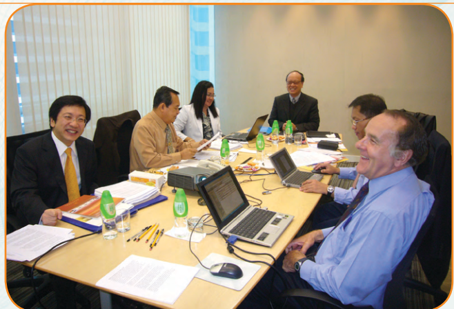
APQN Project Group meeting 「亞太地區質素網絡」研究項目小組會議

總幹事分別於2006年10月及2007年4月出席該網絡在加拿大多倫多舉行之理事會會議及題為《質素保證：時代來臨—經驗學習及為未來謀策》之雙年研討會。2007年6月，總幹事以網絡理事會成員身分，應邀出席於德國波恩舉行之國際研討會，發表重點演說，闡釋如何在全球質素保證發展下加強地區合作。