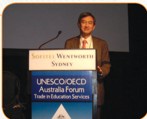
Attending international conference 參加國際會議

In October 2006, the ED attended the 7th General Conference of the Association of Universities of Asia and the Pacific in Macau. Sponsored by the British Council, the ED was invited to attend a two-day conference and a one-day seminar in Edinburgh in December 2006. In addition, invited by the British Council, New Delhi and sponsored by the UK India Education and Research Initiative, the ED participated in an international workshop, held in Hyderabad, India in March 2007, entitled “Collaborative Delivery of Higher Education Programmes in India: UK and India Achieving Best Practice” and delivered a speech on transnational education. In May 2007, the ED was invited to be a speaker on the topic of “Transnational Education — The Hong Kong Experience” in a forum held in Shanghai which was jointly organised by the Shanghai Municipal Education Commission and the Australian Education International of the Australian Government.