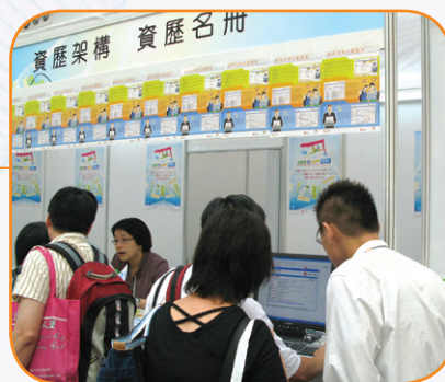
Public showing great interest in trying out the QR prototype 資歷名冊示範版本引起市民廣泛興趣