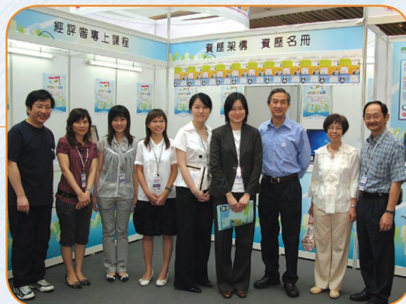
Launch of the QR prototype 資歷名冊示範版本正式推出