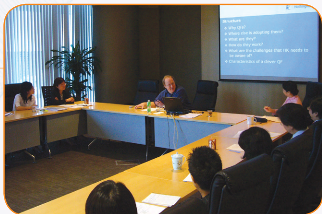
Professional staff discussing with a UK expert at a lunchtime seminar 在午餐工作坊與英國專家交流評審經驗