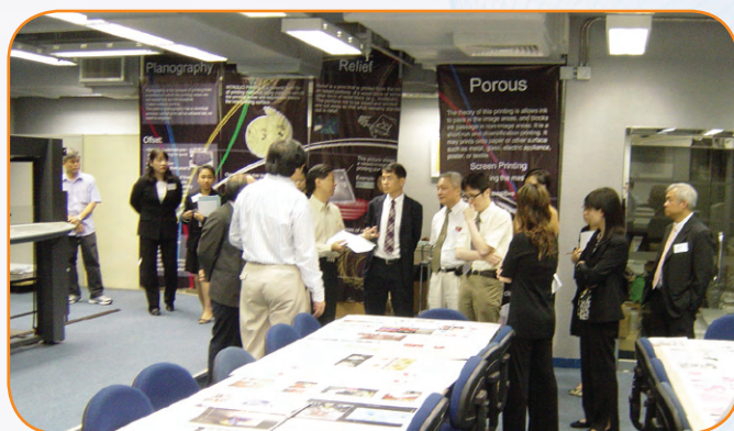
Panel at on-site visits of the pilot exercises 評審小組於先導評審工作中實地考察

資歷架構下設有「過往資歷認可」機制，由受委評估機構執行「過往資歷認可」的評估工作。評審局負責為「過往資歷認可」的候選評估機構進行評審，以確保它們具備相關的專業能力，執行「過往資歷認可」的評估工作。根據法例，只有成功通過「評審當局」評審的評估機構，方可獲教育局委任。本年度，評審局按教育局的政策目標，諮詢了有關團體之意見，並草擬相關的評審程序指引，積極籌備評估機構的評審工作。2007年6月，評審局為三個已制定了「能力標準說明」的行業進行先導評審工作，以測試評審程序指引及相關評審資料的實用性。過往資歷認可先導工作為評審局帶來嶄新的體驗，開拓了傳統評審工作以外的新領域。