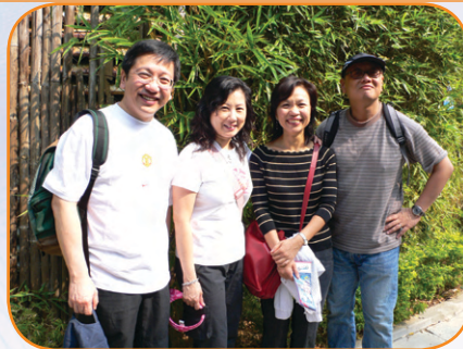
Active and outgoing 活躍外向