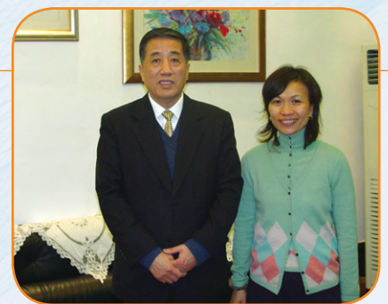
Professional staff attending conferences and attachment programmes 秘書處職員參加國際會議及員工培訓發展活動