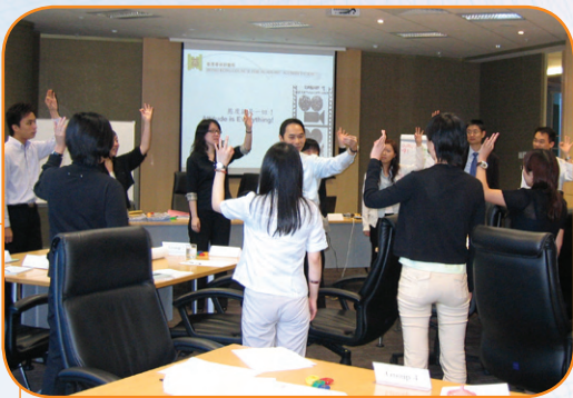
Staff development workshop for Executive Assistants 培訓行政助理工作坊

During the year, staff members had a widened perspective of different systems of accreditation through attendance of regional and overseas conferences and presentations by overseas visitors from quality assurance bodies or government authorities on their vocational education training and quality assurance systems. In addition, a UK-based expert has been engaged, on a retainer basis, to provide training services relating to the development of the QF. Internally, staff members organised a series of information and experience sharing sessions, some as precursors to Sector/Subject Specialist workshops and some as opportunities for those returning from overseas conferences or attachment to relay their learning experience and observations.