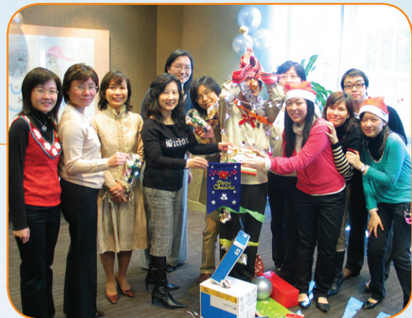
Cheerful and committed team 歡樂及有承擔的團隊